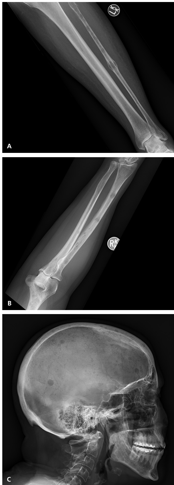
Figure 2. Representative lytic bone lesions in a patient with multiple myeloma. (A) Left leg; (B) right forearm; and (C) skull.

In deciding on treatment options, oncologists take into account disease-specific parameters, such as stage and gene expression profile of the clonal plasma cells, and patient factors, including comorbid illnesses and