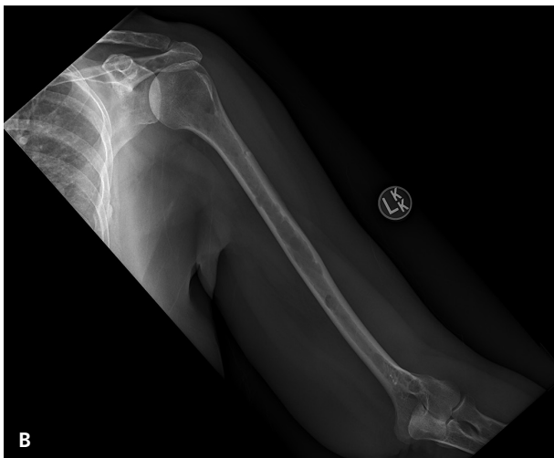
eFigure A. Representative lytic bone lesions in a patient with multiple myeloma. (A) Left femur and (B) left humerus.